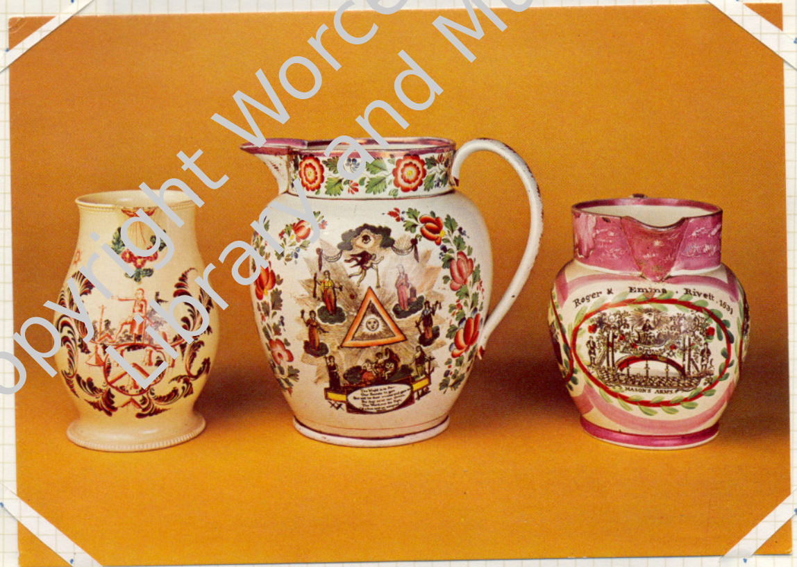
Leeds Staffordshire and Sunderland ware